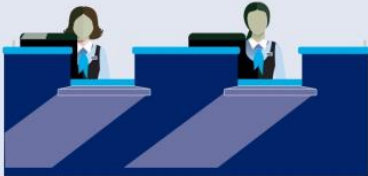
Full Lobby Service