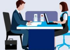
Auto Loans, Home Loans, Home Equity