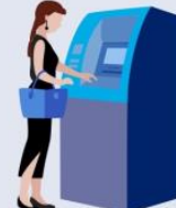
24-Hour ATM, No Fee!